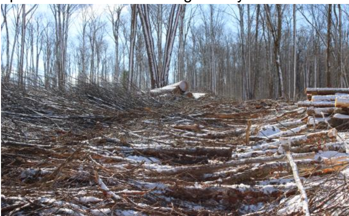
Below is a skid trail with tree tops laid down to protect from run off during muddy months.

Below is a haul road that allows access throughout the property. Landowners appreciate utilizing these trails after the harvest. Additionally, future management activities can make use of these roads.