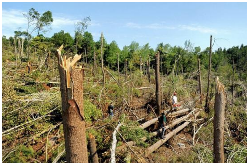
Pictured below is an example of a mature forest that experienced tornado damage in Northeastern Pennsylvania.