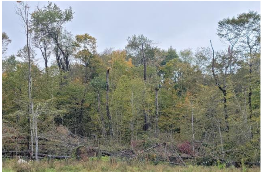
Pictured above is an example of windthrow scenario. These trees have been uprooted and blown down do to high winds. This was a mature maple and cherry stand on State Game Lands in Northeastern Pennsylvania.

Salvage Operation: The highest priority for salvage should be given to products with the highest value. If you have both softwood and hardwood, remember that softwood will degrade more rapidly due to degradation by blue stain. Uprooted or broken hardwood sawtimber trees should be salvaged as quickly as possible, however, depending on the weather and species, salvage can take place months later and still hold value.