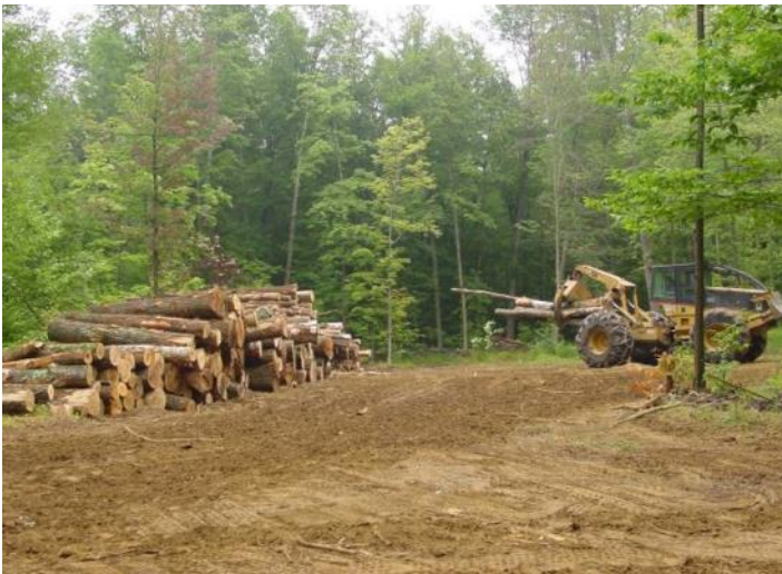
Above is a log landing. From here the logs will be picked up by the log truck.

Landings and roads should be strategically laid out to minimize disturbance and in accordance with topography, property size, and landowner preferences.